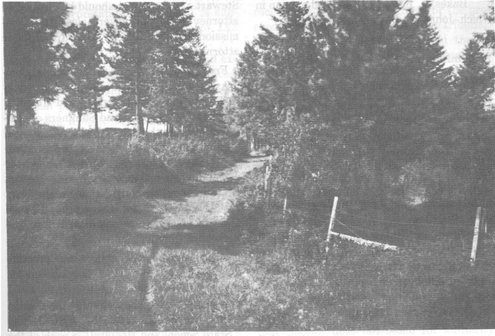
Figure 1: Photograph of “Public Road 460” published as part of the Court’s decision in Taggart v. Highway Bd. for N. Latah Cnty. , 115 Idaho 816, 820, 771 P.2d 37, 41 (1988) (Shepard, C.J.). It is difficult to see in this reproduction, but there is grass growing in this roadway.

Does a change in alignment of a road constitute abandonment of the old road? 144 The quick answer is that is a question of degree. If the current road follows the same basic path as the historic road, the change does not constitute an abandonment of the historic road. On the other hand, if the change is so fundamental that the new road “is no longer in the same location as [the] historical road” then an abandonment may occur. Adams v. United States , 3 F.3d 1254 (9 th Cir. 1993).