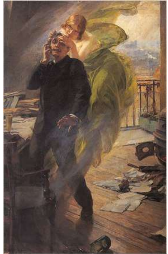
Albert Maigan's Green Muse (1895): A poet succumbs to the Green Fairy.

BTW, Herbsaint and the other absinthe substitutes are liqueurs. Absinthe itself is not technically a liqueur because it has no sugar.