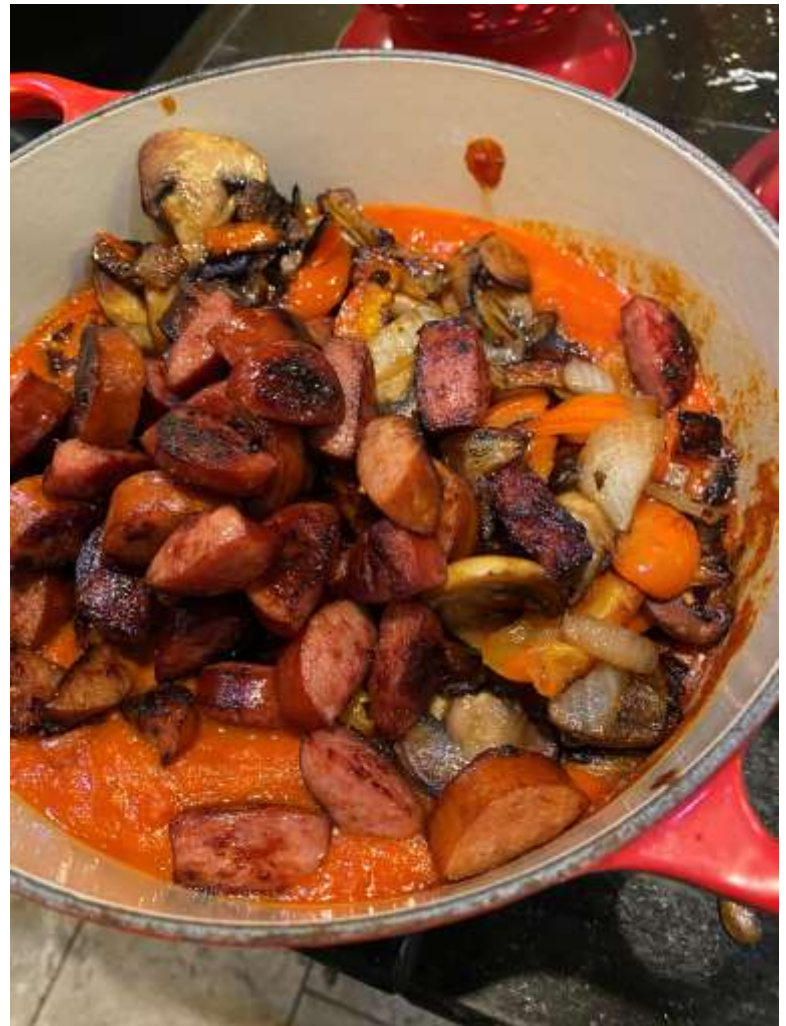
These browned kielbasa pieces and sautéed vegetables are sitting on top of the sauce before being mixed in and put in the oven.

Drain the pasta, add it to the sauce in the pot, toss. Serve with grated Parmesan or Romano.