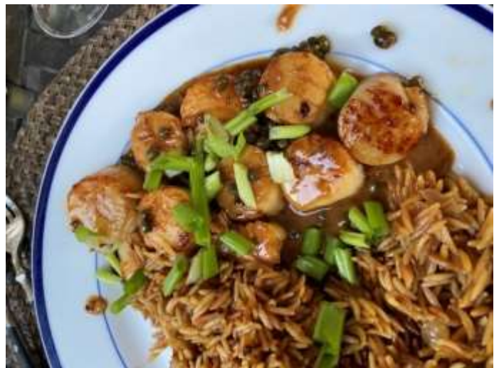
Plate the scallops, topped with a sprinkle of chopped scallions.