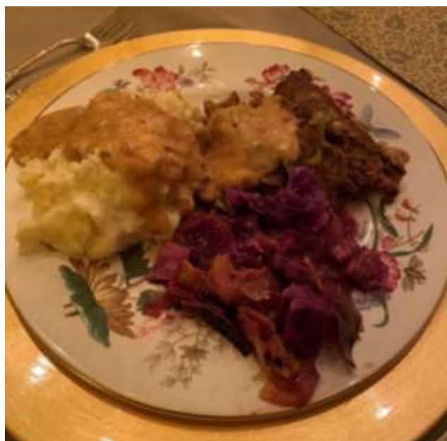
Rouladen with mashed potatoes and German sweet & sour cabbage

Sauté finely chopped onion with the reserved bacon grease in large frying pan with some bacon grease until deeply golden. Remove the onion, but SAVE THE PRECIOUS BACON GREASE for browning the rouladens.