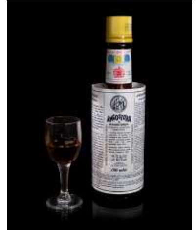
The Angostura bitters bottle is noted for its distinctive over-sized label.

See discussion under "Mexican Manhattan" on page 31.