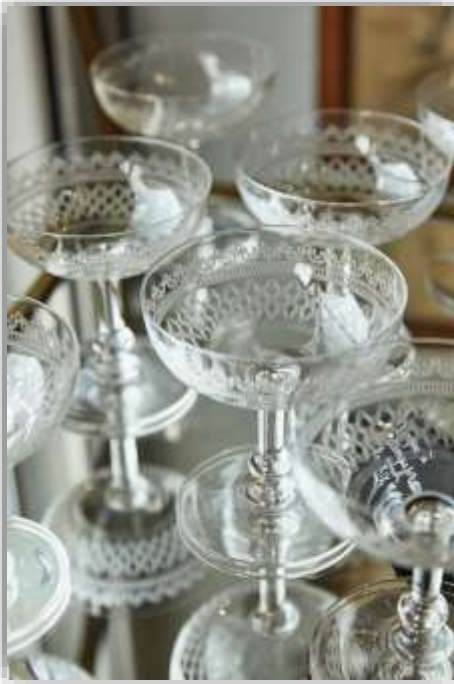
Etched coupe glasses

Coupe is a type of champagne glass with a flat bowl. The French pronounce it “coop” (with a silent “e”). It should not be confused with the other French word, coupé (with an accent mark), which refers to a sporty car and is pronounced “coop ay.”