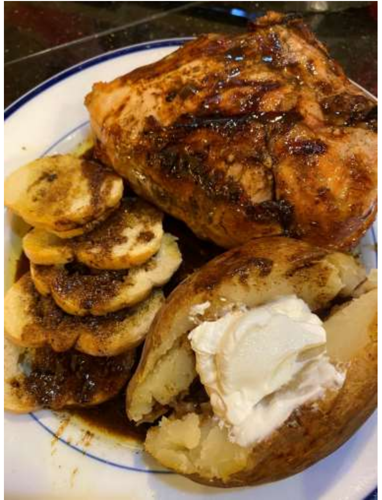
This batch happened to be made with left-over baguette slices from yesterday's dinner party. Any good bread works!

Remove the chicken, tent it and let it rest a while. (Optional: After it has rested, cut deep gashes in the chicken before saucing – allowing it will soak up more sauce.)